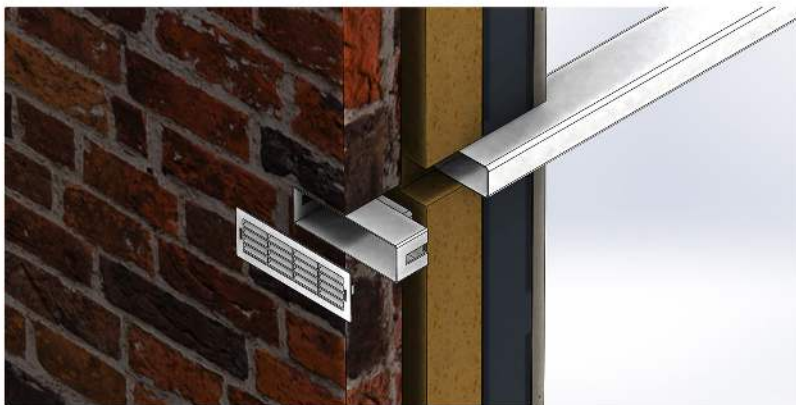
* DUCVKC704/DUCVKC714 Grilles not included in the DUCVKC247.