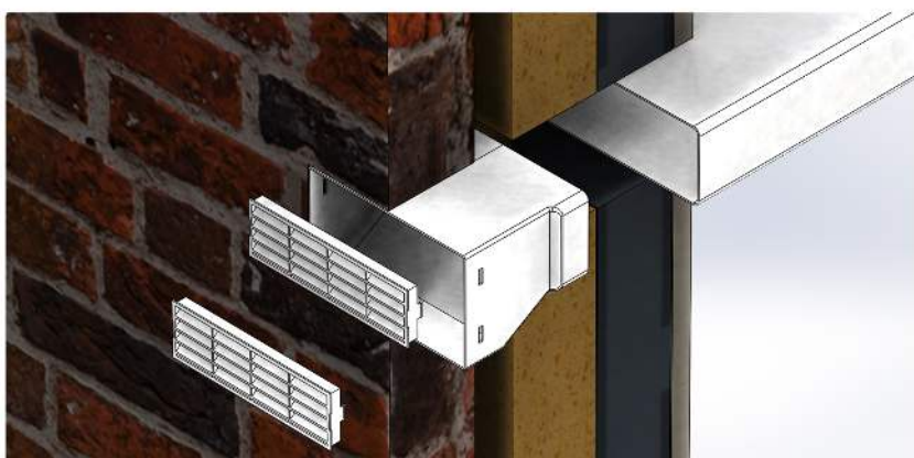
* VKC704 Grilles not included in the VKC5733. For Grilles please use code VKC5733G